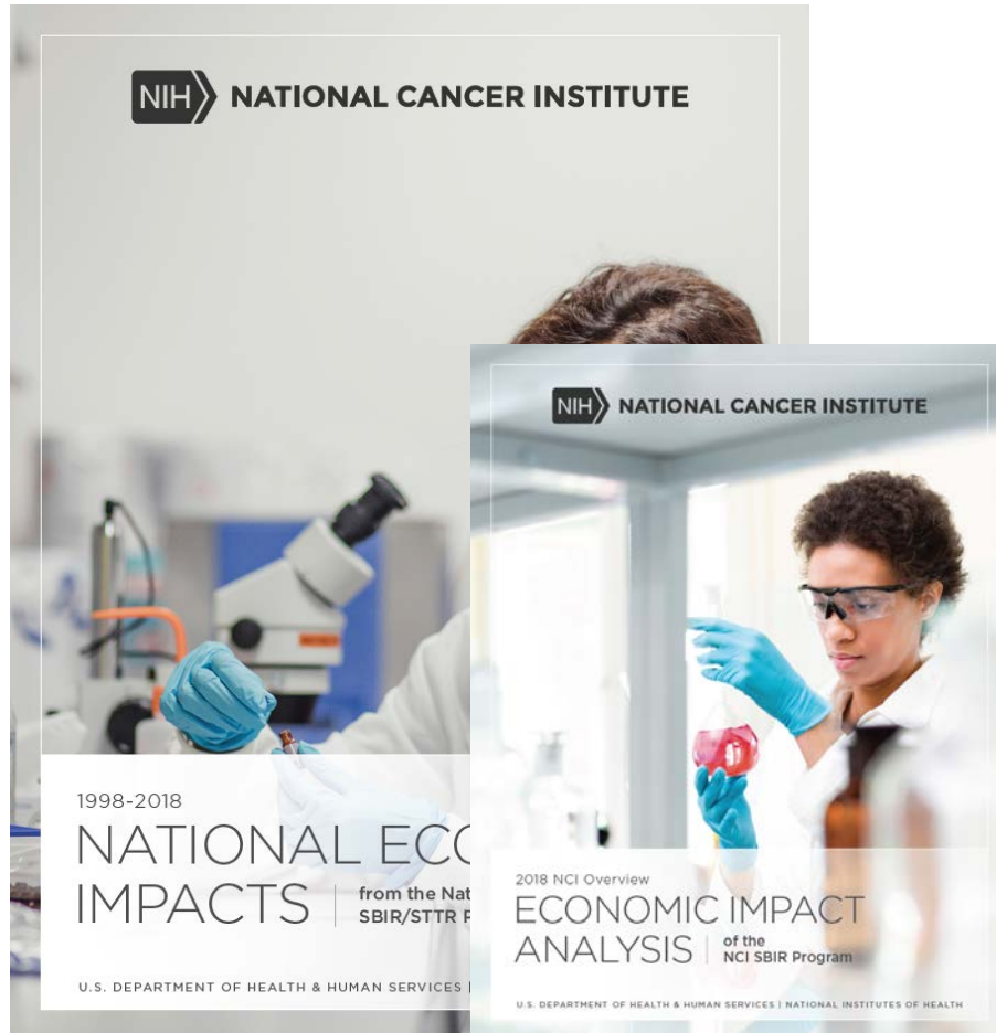
Study Report and Brief – Released 2019